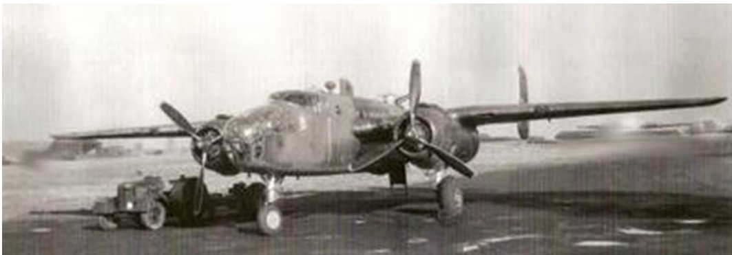
North American B-25 Mitchell

The B-25 Mitchell was a twin-engine, medium bomber (also modified as a gunship) manufactured by North American Aviation. It carried a crew of six, a three thousand pound bomb load, and depending on the variant, twelve to eighteen .50 caliber machine guns and a 75 mm cannon. Nearly 10,000 were produced and operated during World War Two by the air forces of Canada, Great Britain, Australian, the United States, China, the Soviet Union, France, and the Netherlands. The Mitchell gained notoriety in April 1942 when sixteen of the type took off from the carrier USS Hornet , and led by Lieutenant Colonel Jimmy Doolittle, successfully bombed Tokyo and four other Japanese cities. The "J" variant investigated at Gander by the RCMP was one of 316 received by the RAF and known in that service as the Mitchell III. The "J" variant was the last factory series production of the B-25. Mitchell KJ680 survived the war and was struck off the RAF inventory in June 1947.